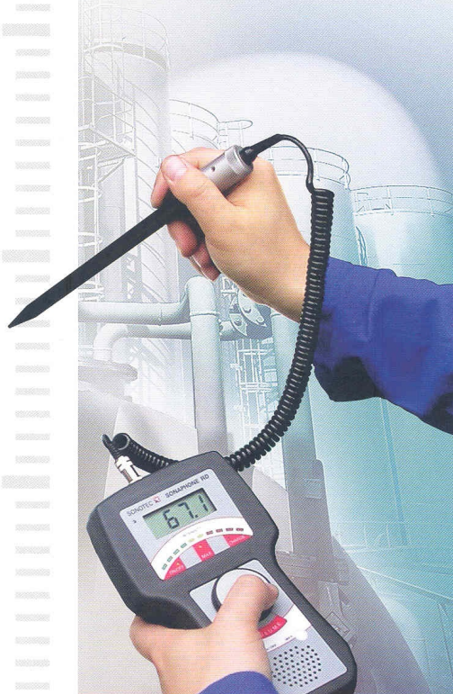
SONAPHONE RD Ultrasonic detector

User friendly Quick response time Reliable Low cost